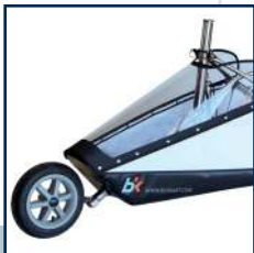
POD COMPLETE All-weather sailing machine.