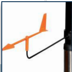
WIND INDICATOR Wind Indicators are an essential apparatus.